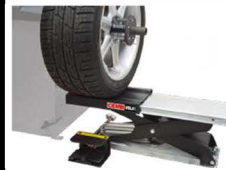
Pneumatic Wheel Lift 46FL85170