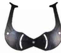
Rim Width Gauge 46FC77653