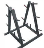
Accessory Rack 41FF03151