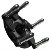
Pin Plate Adaptor Manual - 41FFA6478 Pneumatic - 41FFA5298