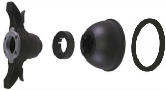
Manual Locking Kit 41FF83148